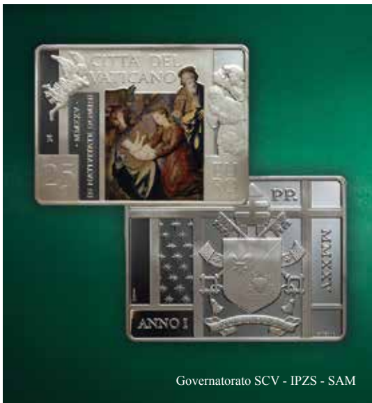
Governatorato SCV - IPZS - SAM